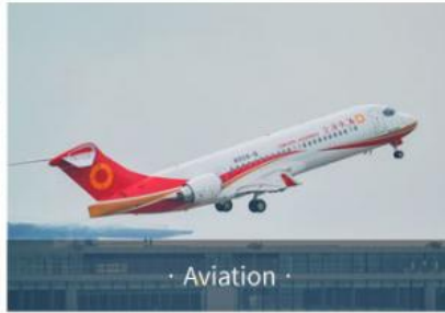
· Aviation ·