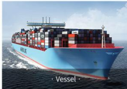
· Vessel ·