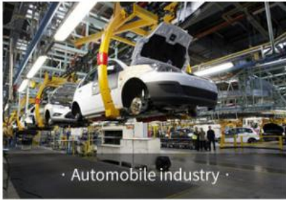
· Automobile industry ·