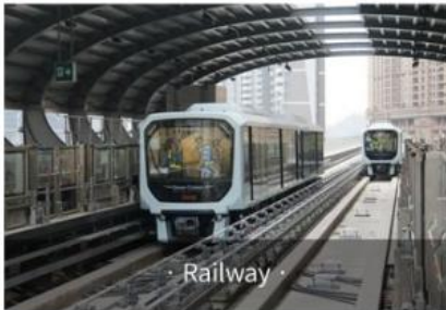
· Railway ·